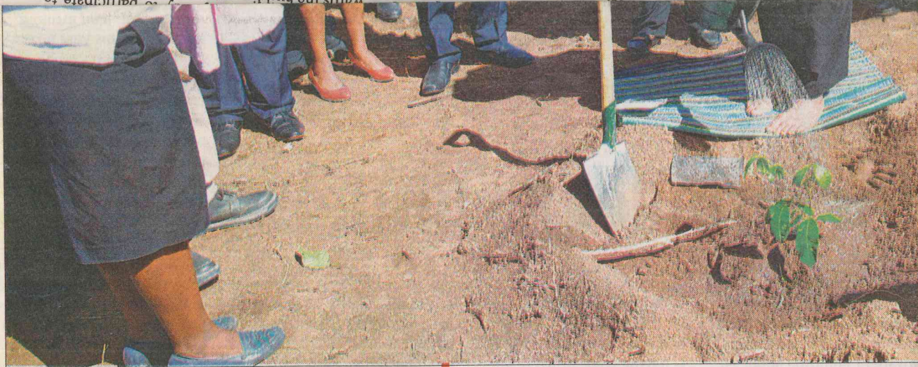
VICE-PRESIDENT Samia Suluhu Hassan plants a tree to celebrate the World Environment Day at national level in Butiama Village in Mara Region, yesterday.